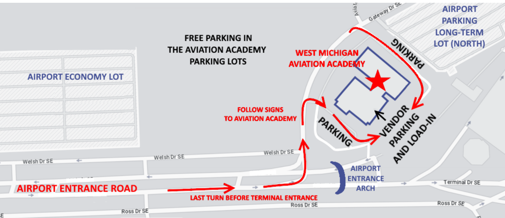
The Aviation Academy (Model Contest) is on the Airport Grounds of Gerald R Ford International Airport