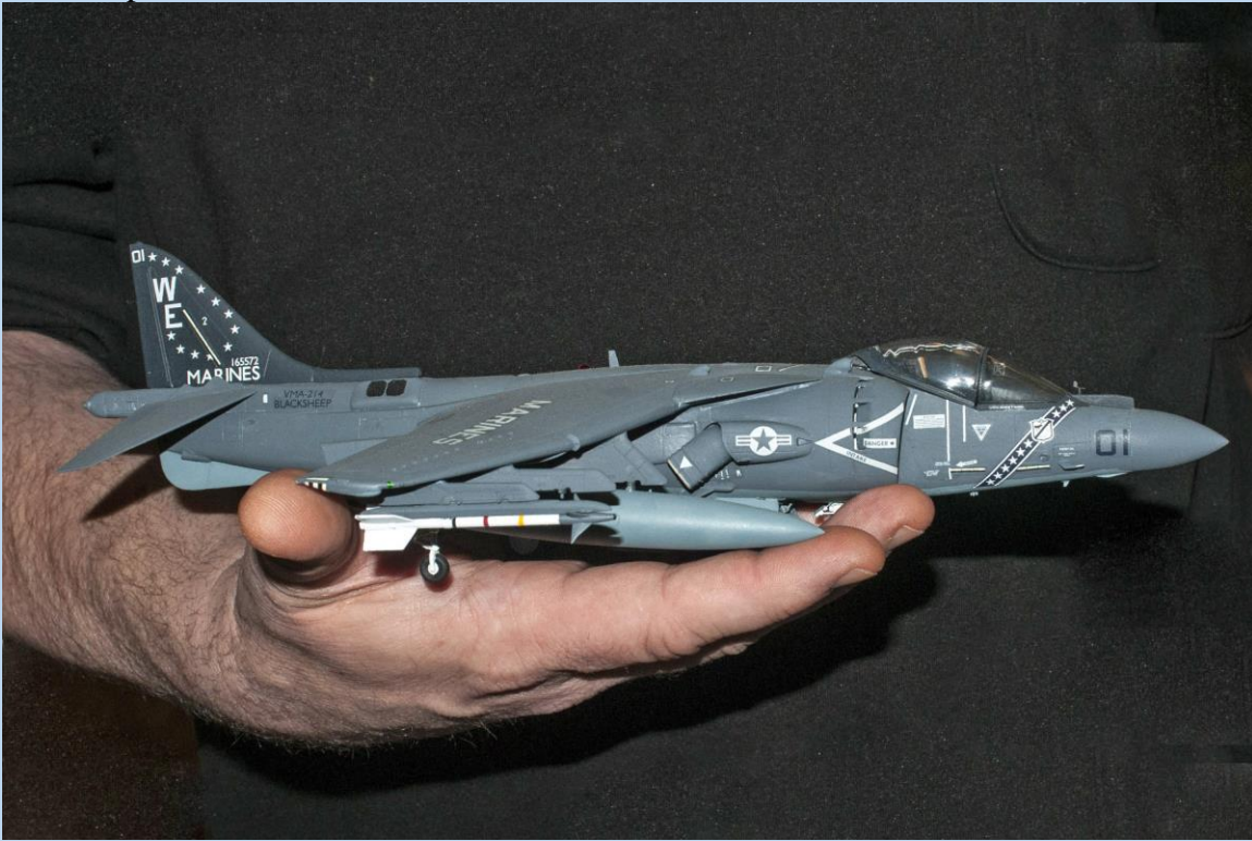
1/48 Hasegawa AV-8B Harrier II