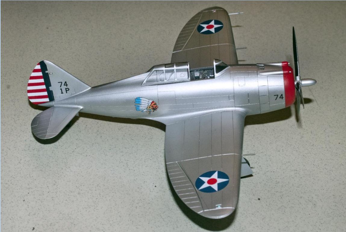
Dora Wings 1/48 Republic YP-43 Lancer 1st PG / 94th PS Selfridge Field, Michigan April 1941