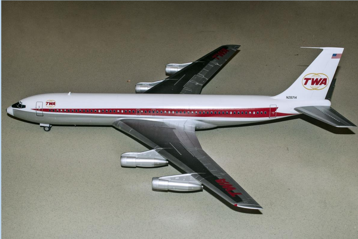
1/100 Entex Boeing 707-331B - TWA St. Louis Lambert International Airport April 1975