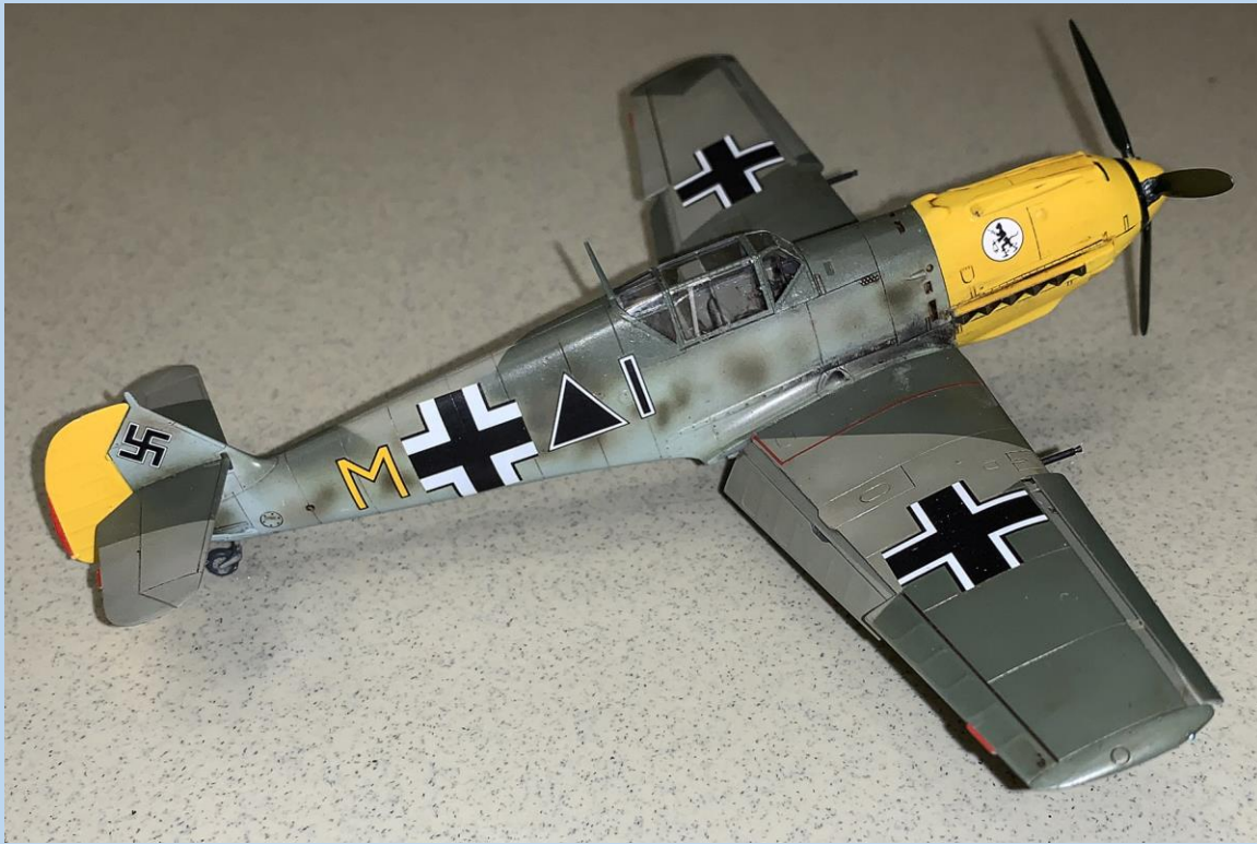
1/48 Tamiya BF109E-3

Painted with Gunze Sangyo RLM 71/02 over RLM 65