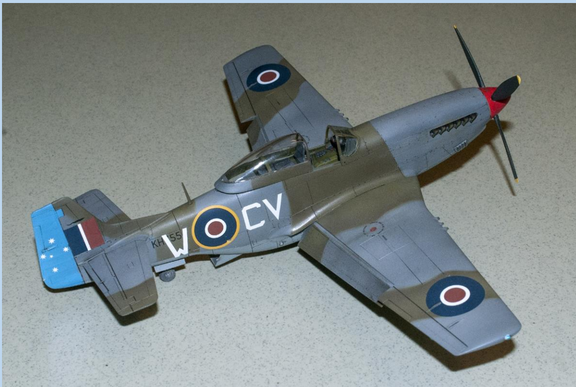
1/48 Tamiya P-51D (Mustang IV)