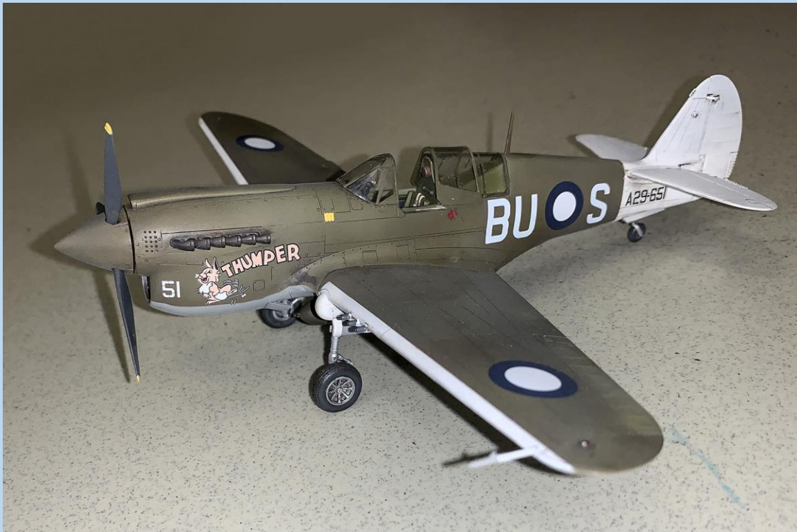
1/48 Hasegawa P-40N