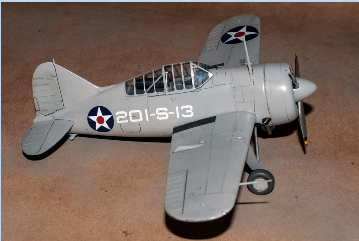
F2A-2 Buffalo Starfighter Decals F2A Buffalos Neutrality Gray Tamiya XF-19 Sky Gray and XF-2 Flat White Mixed 50/50 VS-201 USS Long Island Summer 1941