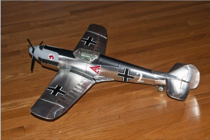
1/16 Gulliw, Bf-109, balsa

Balsa wood understructure with formed aluminum skins applied. Not representative of a specific 109 type and decals were sourced from whatever John could find!