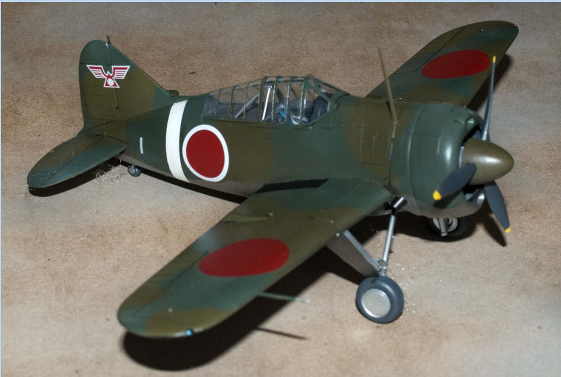
Tamiya B339 Buffalo LF Model Decals Buffalo Over Japan Tamiya XF-62 and XF-49 Khaki over Alclad White Aluminum Captured Dutch Aircraft Java 1942