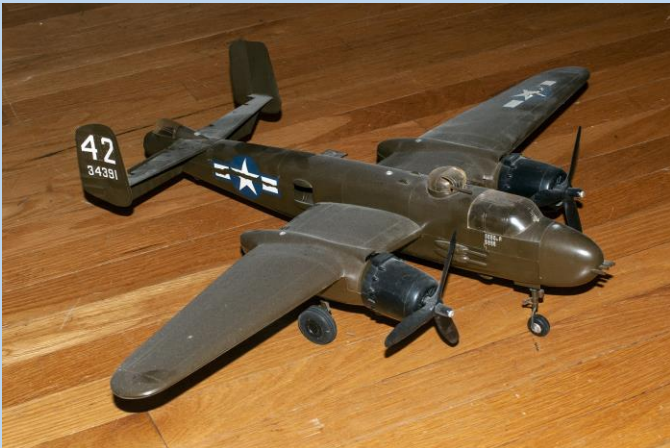
1/32 Aurora B-25