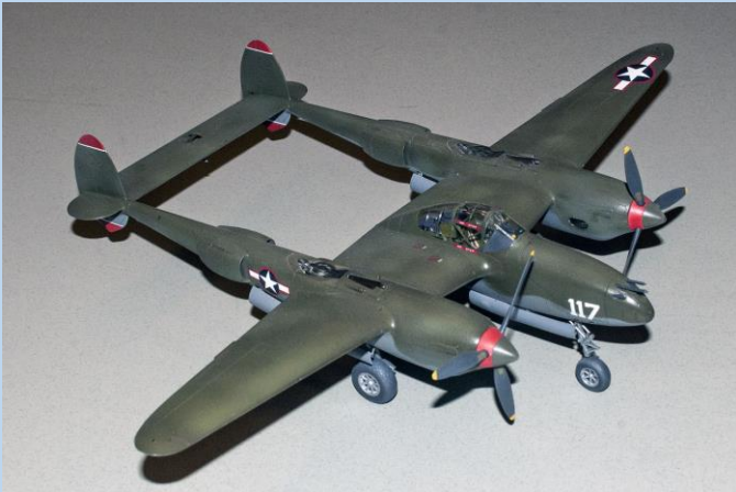
1/48 Tamiya P-38F/G

Paints used: AK Interactive Olive Drab 41 over Neutral Gray