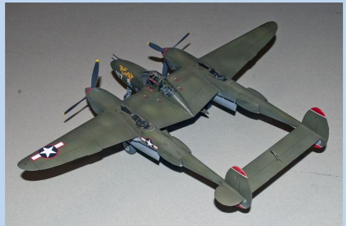
Decals are Aeromaster Fork Tail Devils Part II “Hold Everything” 431FS/475 FG New Guinea 1943.

Paints used: AK Interactive Olive Drab 41 over Neutral Gray