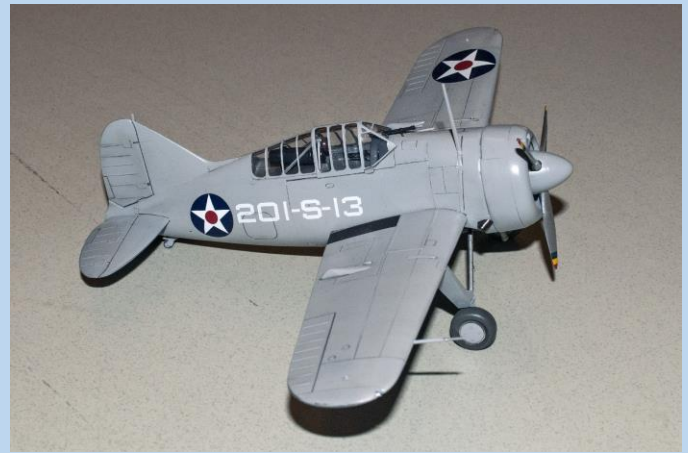
Tamiya XF-19 Sky Gray and XF-2 Flat White Mixed 50/50 Neutrality Gray, Starfighter Decals F2A Buffalos VS-201 USS Long Island Summer 1941