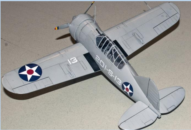
1/48 Tamiya F2A-2 Buffalo