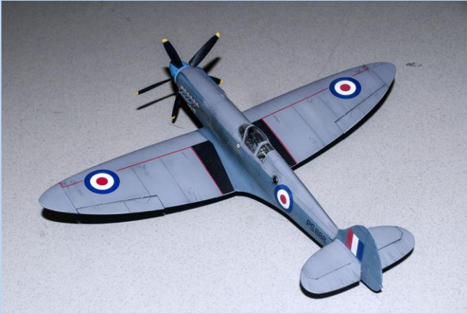
1/48 th Scale Airfix PR XIX

Markings are for No. 81 Squadron Royal Air Force Seletar, Singapore, April 1, 1954. the decals are from the kit and printed by Cartograph