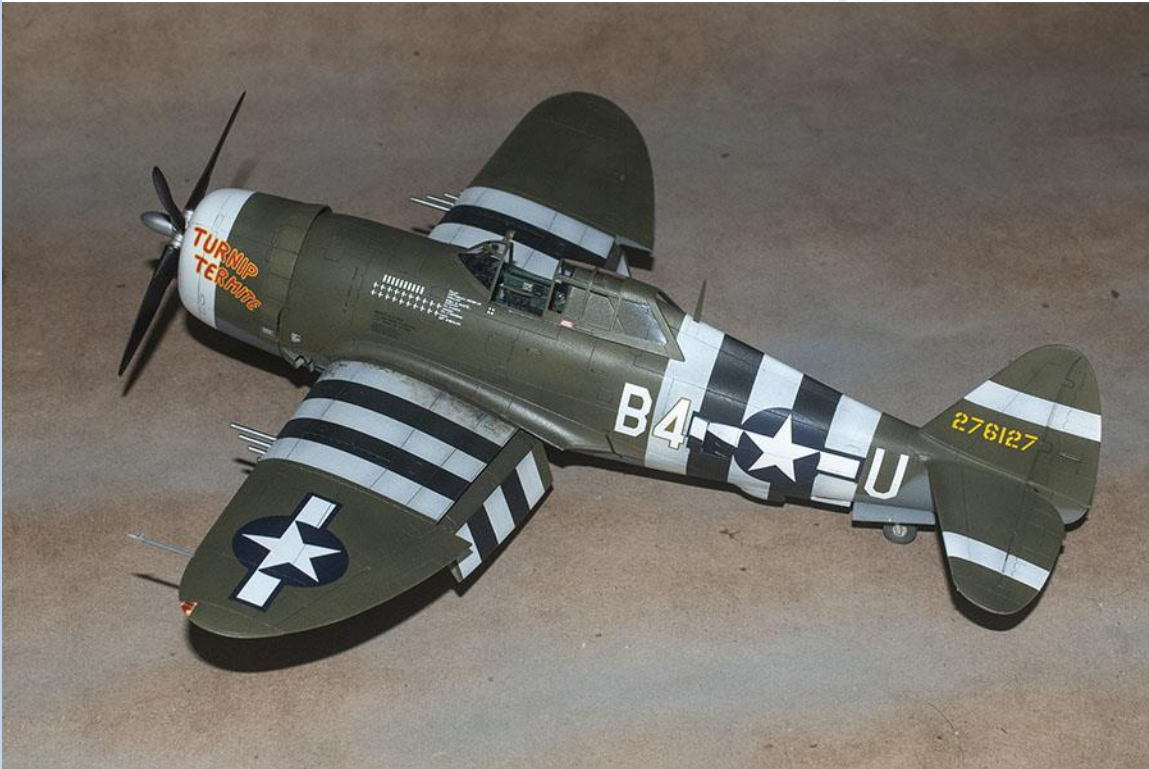
TURNIP TERMITE Capt. Arlo Henry 387 th FS/365 th FG 7 June 45 ThunderCals 48006 ETO Pt 1 Markings for 6 a/c... Razorbacks and Bubbletops Available at Thundercals.com Model by Mate