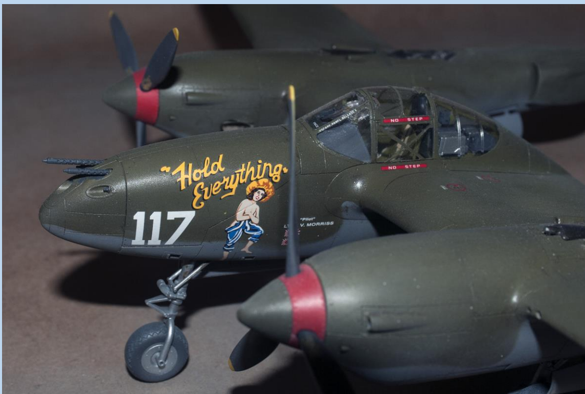
Decals are Aeromaster Fork Tail Devils Part II “Hold Everything” 431FS/475 FG New Guinea 1943. Paints used: AK Interactive Olive Drab 41 over Neutral Gray

F/G models, H's had larger supercharger intakes and differences in the interiors. In addition, the rear cockpit glass did not have the interior reinforcing strips present on the F/Gs.