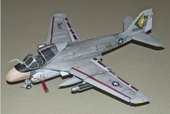
1/48 th Scale Hobby Boss A-6E Intruder.