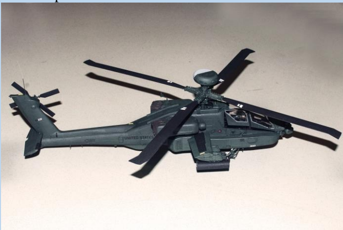
1/48 th Scale Hasegawa AH-64D Longbow An Eduard detail set and Master Model Brass chain gun were additional accessories used on this build. Paints used were Tamiya Acrylics. The main color is a mix of (70%) Black Green and (30%) Flat Black