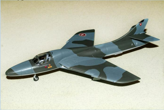
1/72 nd Scale Matchbox Hawker Hunter T67