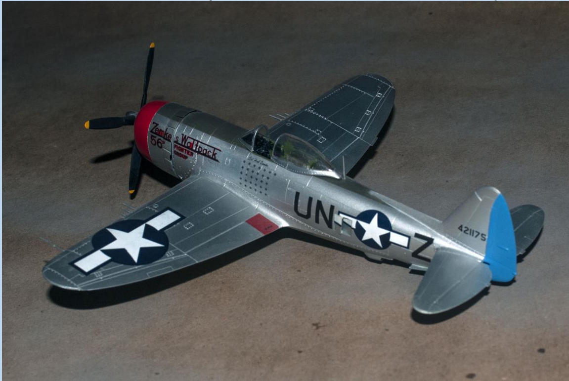
Model by Charles Scardon

Built out of the box, SNJ metallic was applied over a basecoat of Testor's Gloss White. In fact, I used the Testor's small square bottle line. Often overlooked, there are many excellent colors available. The red for the cowl is #1103 (not an insignia red.) The blue rudder is a mix of #1110 Bright Blue and #1145 White.