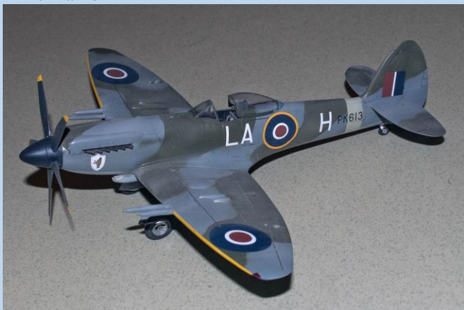
1/48 th Scale Airfix Spitfire Mk. 22/24