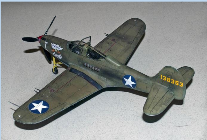
1/48 Scale Eduard P-39 Airacobra Limited Edition kit