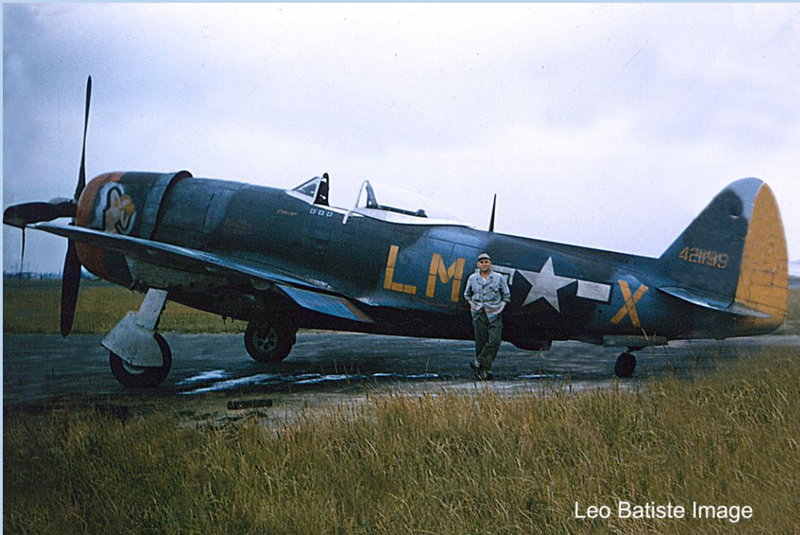
Two images above: S/Sgt Grimes posing by artwork