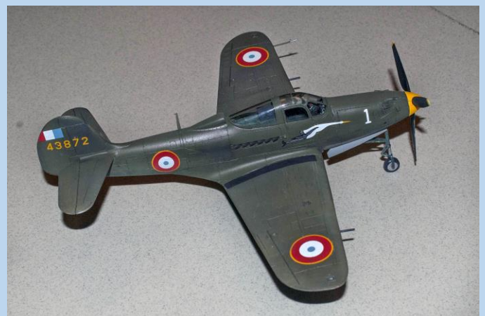
1/48 Scale Hasegawa P-39Q GCII/6 Travail Summer 1944.