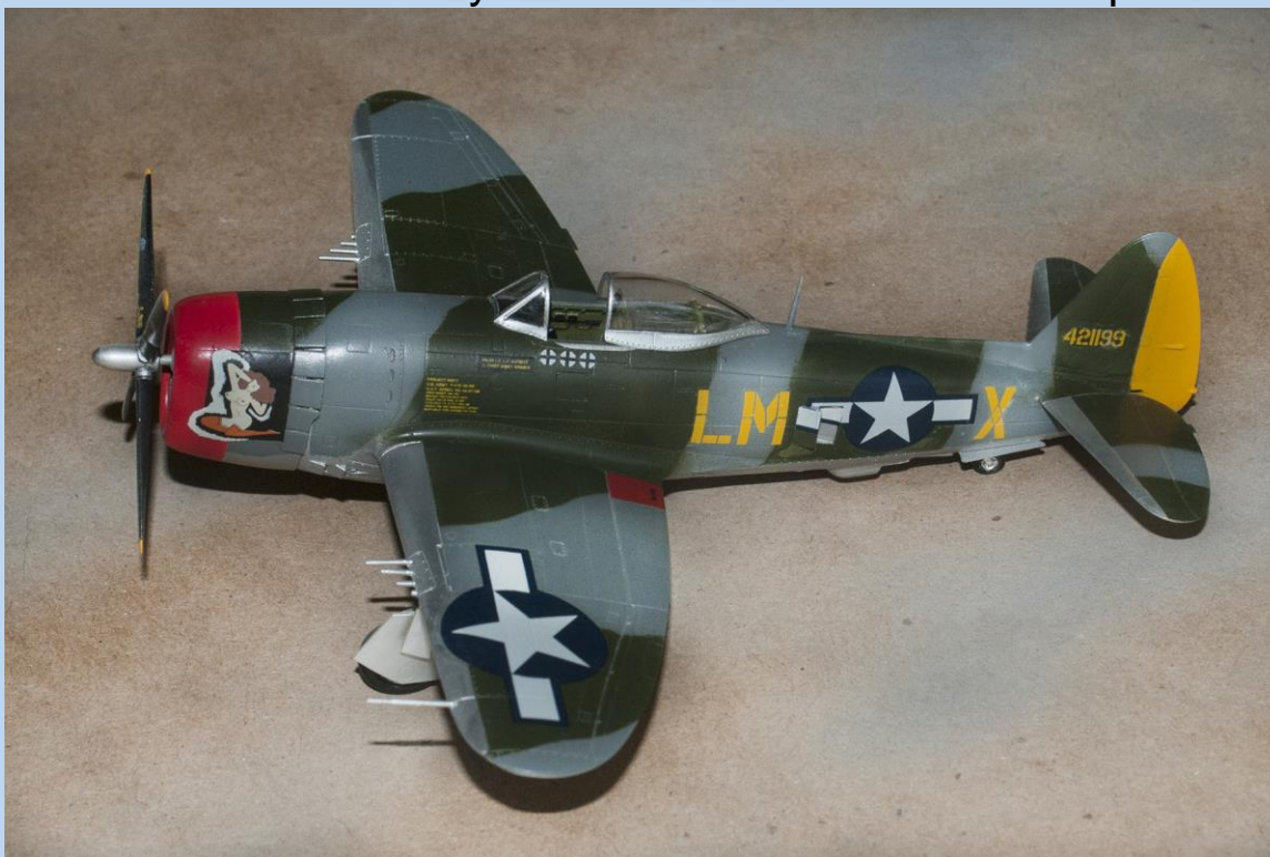
Model by Charlie Scardon Additional notes/ images by Thundercats

Until the Tamiya 1/72 nd release, this was the best available. A Simple build. No changes or alterations to the kit. The plastic is soft and care has to be taken cutting out the propeller. No flash no sink marks and appears to be correct for the M. The cowl flaps are uneven. That is the worst part of the kit. The belly may be a little deep for some modelers taste.