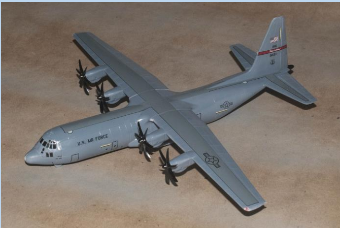
1/144 th Scale Minicraft USAF C-130J-30 Markings: 143 rd AW, Rhode Island ANG 2007 Kit decals

The kit brought for show and tell was new kit by Minicraft. The C-130 has served in the US Air Force for over 50 years; you could probably build 30 to 40 different variations of this plane. The Super Herc is the latest version featuring an extended fuselage and updated engines and the new 6 bladed props. This version from Minicraft C130J-30 features new fuselage tooling of this latest version. The kits also features the new "J" engines, recessed panel lines, interior cargo bay, and a position able rear door and updated engines with the unique scimitar props. It also includes 2 USAF marking: