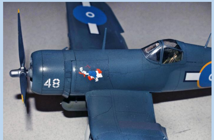
1/48 th Scale Tamiya F4U-1A New Zealand markings Eagleclads Decals Tamiya Paints mixed to faded Dark Sea Blue and Intermediate blue over white NZ5248 bUnO 56455 No.21 Squadron RNZAF May 1945