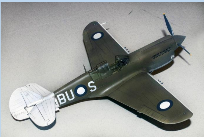
1/48 th Scale Hasegawa P-40N Australian markings