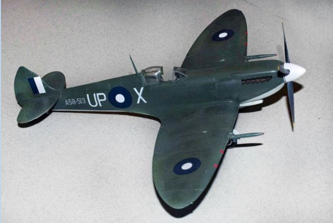
1/48 th Scale Eduard Spitfire Mark VIII RAAF Moratai 1945

Gunze Sangyo Paints FS34092 (Foliage Green) over RLM 76 (underside light blue) Eagle Strike decals