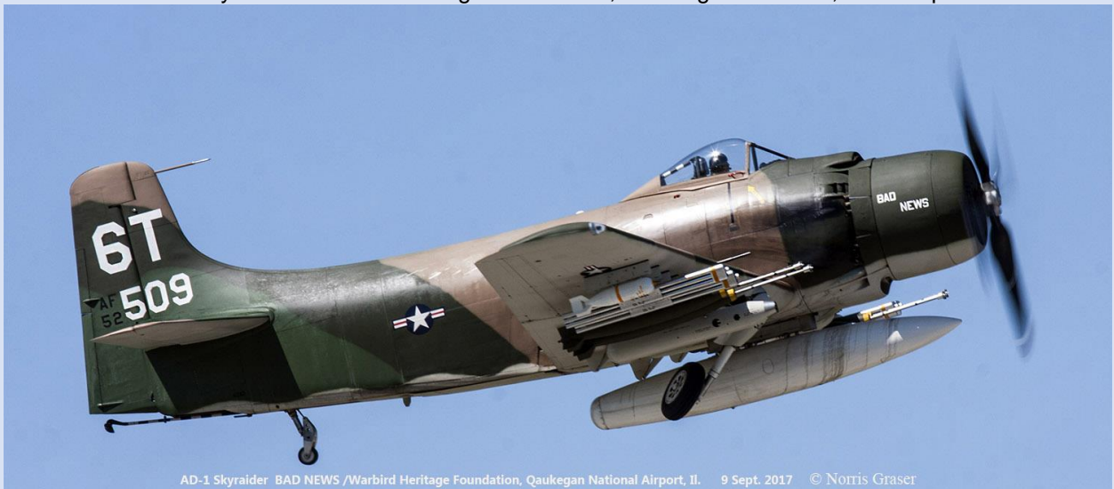
AD-1 Skyraider BAD NEWS /Warbird Heritage Foundation, Qaukegan National Airport, Il. 9 Sept. 2017