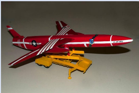
Northrop SM-62 SNARK 1/48 th Scale Lindburg reissue (J Lloyd International) This is a BIG missile! Most of the work is spent on the launching platform.