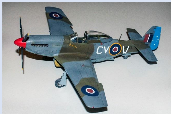
Painted in Firewall camouflage scheme. Gunze and Tamiya paints. Underside Tamiya XF-83 Medium Sea Gray Upper camouflage Tamiya XF-24 Dark Gray Gunze Sangyo H-51 Olive Drab {1} Flory water soluble dark wash