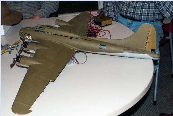
Boeing B-17G 1/32 nd scale HK Models

Painted in Olive drab, with metal engines on the left wing. John is trying to light up the interior and wing tips. He did not say what he was using for a power source but it looked like a transformer (model train) which had an accessory terminal for adjustable voltage. 2 of the engines were casted in nickel chrome and bronze. He found special rubber tires for it. It should be quite something to see when it is finished. I do believe I saw smoke when lit.. ☺