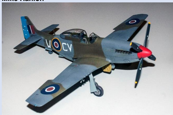
North American P-51D Mustang, Tamiya Ultracast Aeroproducts propeller, Decals by Xtradecals. Camouflaged and markings for Mustang Mk.IVA, KH755/CV-W, "Anita" of No.3 (RAAF) Squadron, Cervia, Italy, April-May 1945.