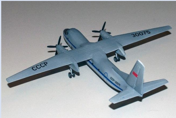
AN-30B, 1/144 th Scale, Eastern Express Models. Russian observation/photo geography aircraft.