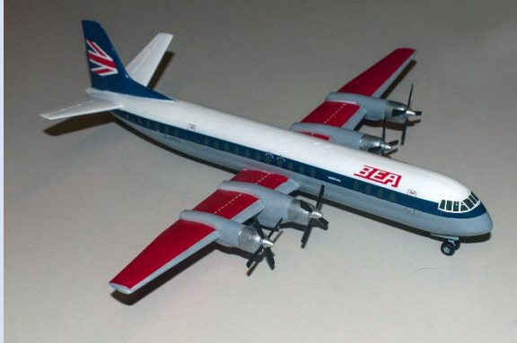
Vickers Vanguard/Merchantman 1/144 th Scale Airfix