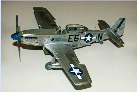
North American P-51D Mustang 1/48 th Airfix Used AIClad metallic paints