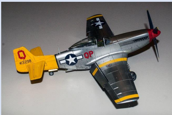
North American P-51D Meng Models Alclad Metal paint, Tamiya Acrylics and Aeromaster decals