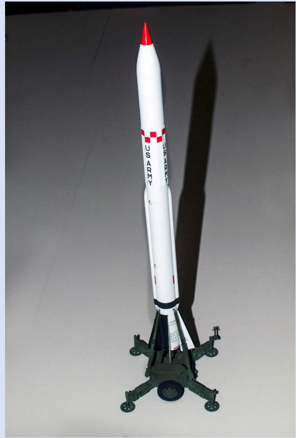
Corporal Missile 1/35 th scale Revell