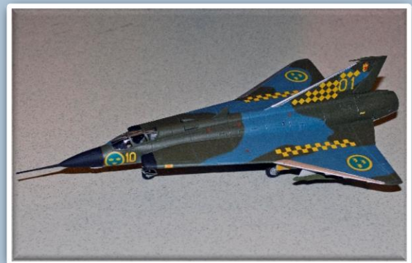
Draken Carl Geiger