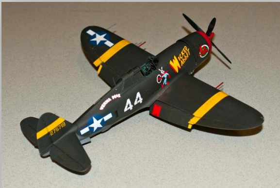
P-47D-15-RE Thunderbolt, 1/48 th Scale, Tamiya, Rising Decals. MMaster and Floquil Paint