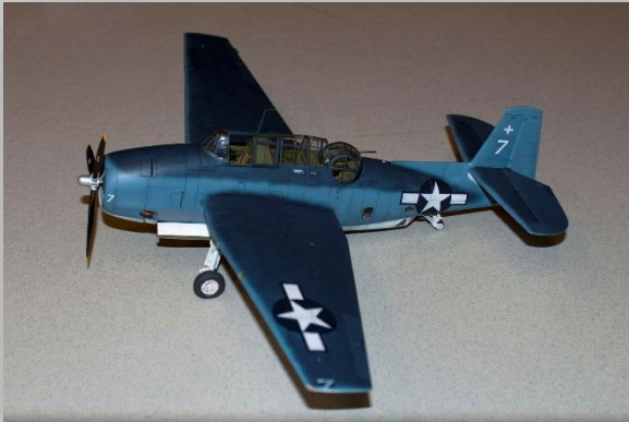
TBM-1C Avenger, 1/48 th scale Accurate Miniatures. VT-18 USS Intrepid Phillipine Sea