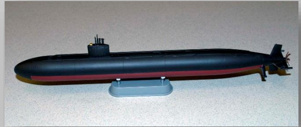
USS Greenville, 1/700 th scale Hobby Boss. Model master Acryl paint by Paul Gasiorowski