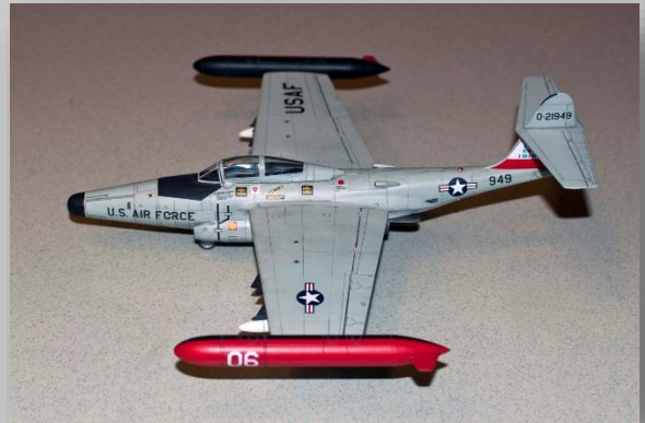
F-89J Scorpion all weather interceptor. Weapons included air to air Genie missile