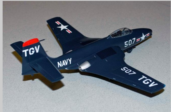
Glenview training squadron. If you are familiar with the kit, you will appreciate the work that went into it.