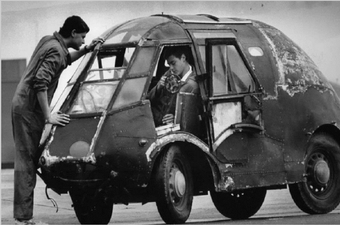
Blenheim Mki nose converted to car. Model project for Lygiros??