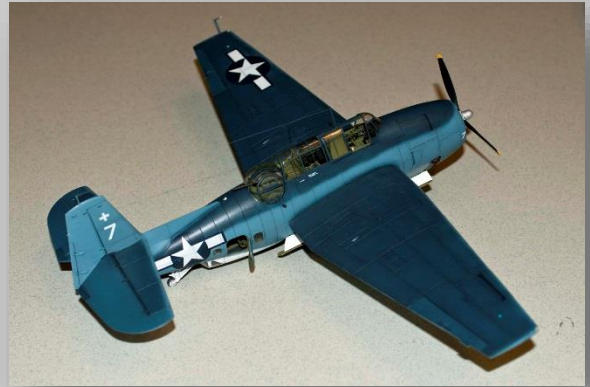
Oct 1944 Eduard Photo Etch, Master Model guns barrels, MMaster/Aeromaster paint SuperScale Decals Model by Ed Mate