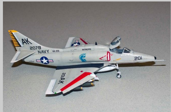
MMaster paints, Afterburner Decals, Aires ejection seat, G-Factor landing gear